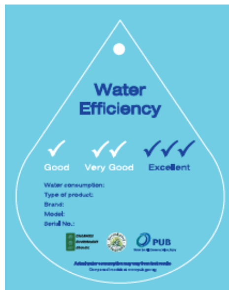
Figure 2: Water Efficiency Label for Voluntary WELS