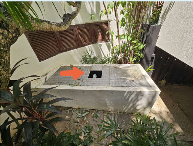
Near the main gate or guardhouse area