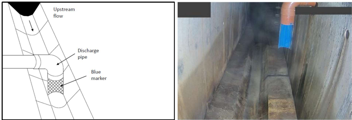
Figure 2. Example of Blue-Marker painted on cut-opened discharged pipe.