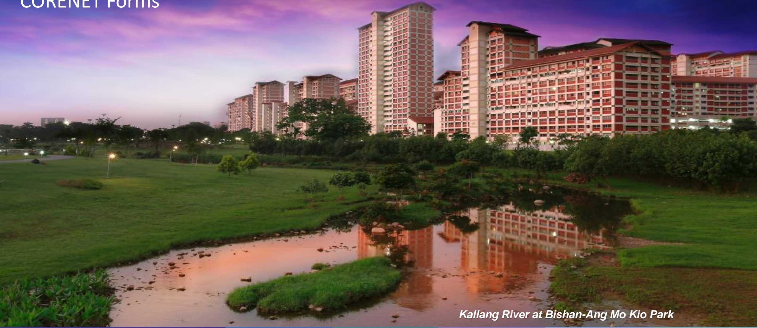
Kallang River at Bishan-Ang Mo Kio Park