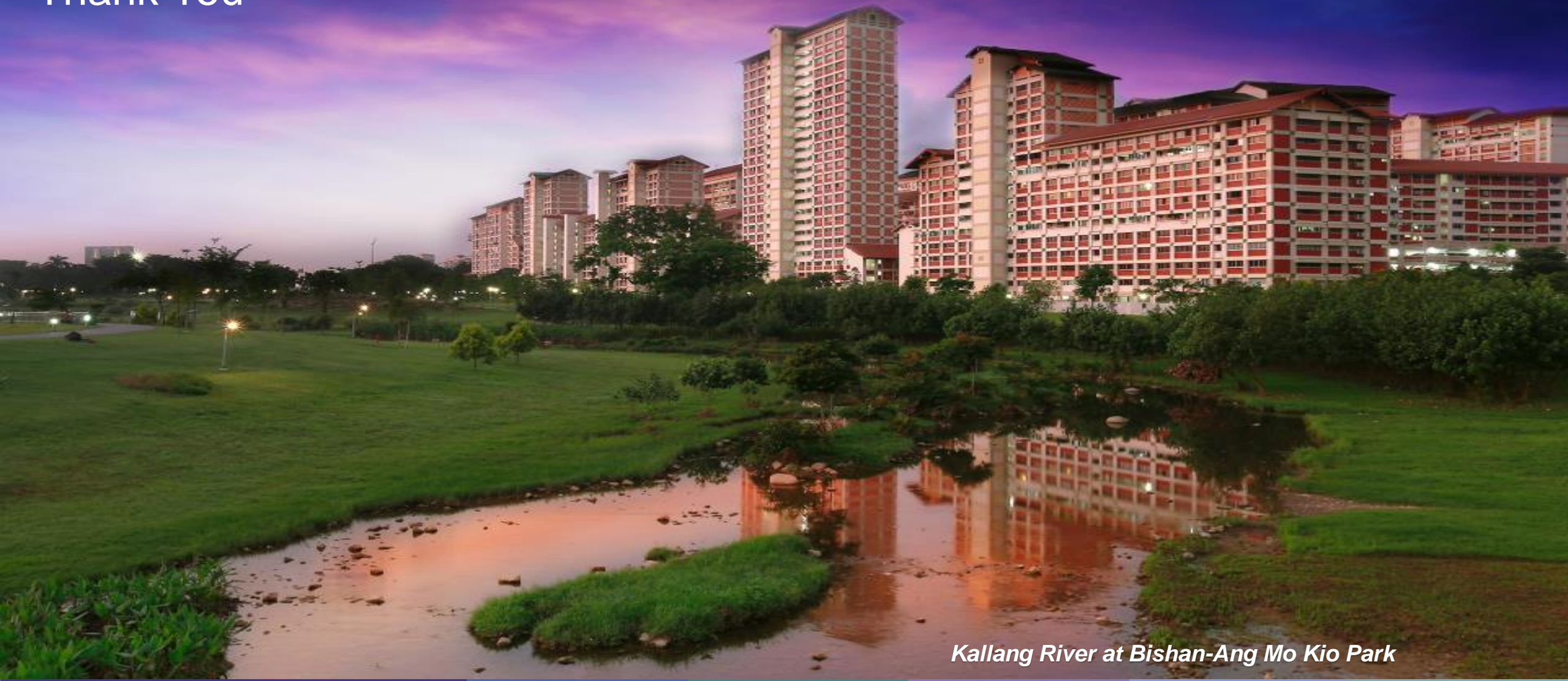
Kallang River at Bishan-Ang Mo Kio Park