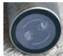
Sensor with ultrasound cleaning system After 16 Days