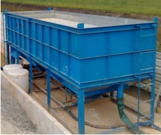
Model: FP-WW-40, Capacity: 40m 3 /hr

ULTRA-ECM SILT & SEDIMENT TREATMENT SYSTEM for Storm-Water Management Earth Control Measure