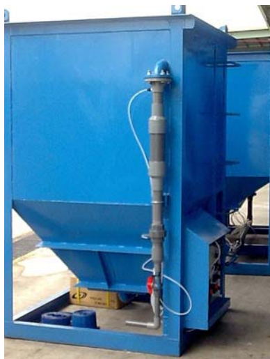
Model: FP-WW-05, Capacity: 5m 3 /hr